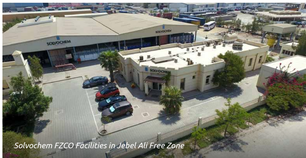
Solvochem FZCO Facilities in Jebel Ali Free Zone