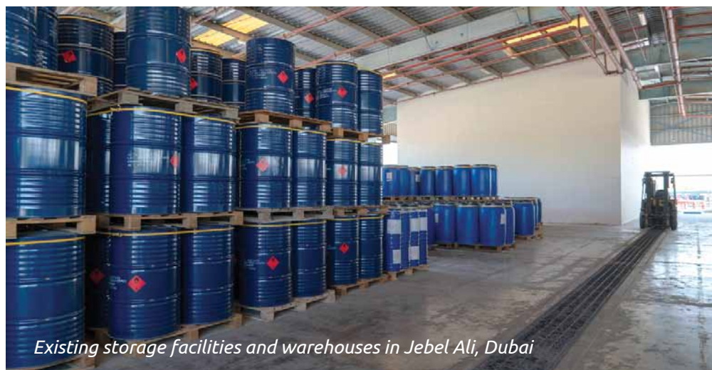
Existing storage facilities and warehouses in Jebel Ali, Dubai

At Solvochem, we have the latest state-of-the-art facilities and safety systems to ensure safe handling of AvGas. Our professional staff are trained to handle operations, logistics and customer needs. We have extensive knowledge of all logistical requirements for local UAE or for export deliveries.