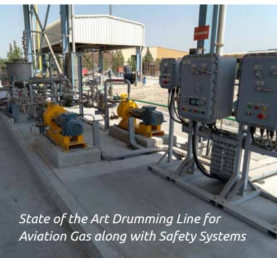
State of the Art Drumming Line for Aviation Gas along with Safety Systems